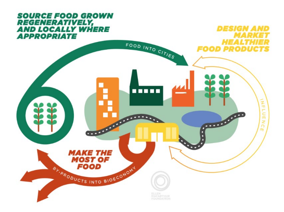
Figure 1 The Three Pillars of a Circular Economy of Food

The Ellen Macarthur Foundation's CEF diagram distinguishes three broad pillars in the CEF (Ellen Macarthur Foundation 2019):